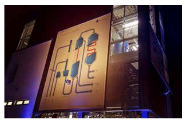
Fig. 2: Pilot plant at Sunfire

The SOEC electrolysis of H_2O is currently being further developed to co-electrolysis of H_2 and CO_2 and is going to replace (from 2020 expectedly) the two-stage synthesis gas production by one process step thus saving costs of investment and operation.